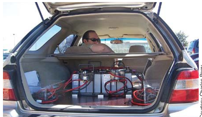
Figure 2. External electric drive system added to rear wheels

The patent-pending process will allow any vehicle or small truck to be converted to plug-in hybrid operation.