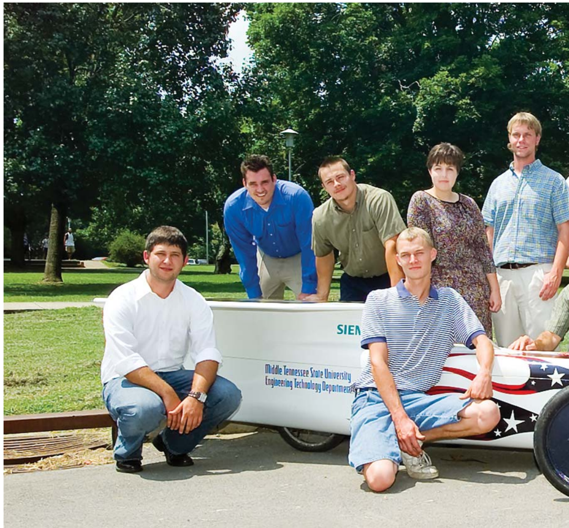
MTSU Department of Engineering Technology and Industrial Studies students build solar-powered cars for

MTSU's Department of Engineering Technology is one of the frontrunners in advancing knowledge of the alternative fuel industry.