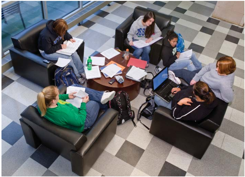
Students studying in the south lobby of the Business and Aerospace building.