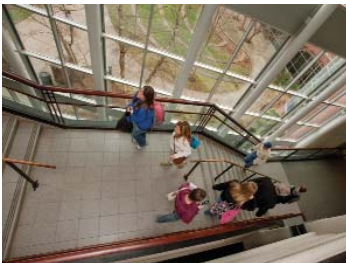
Stairwell in the south lobby of the Business and Aerospace building.