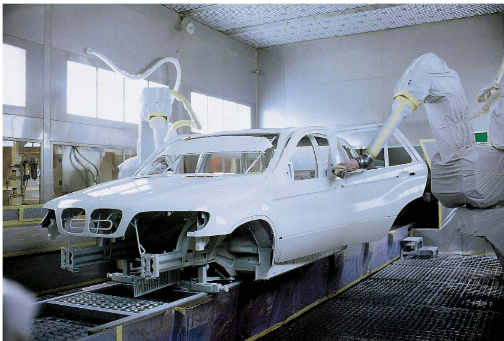
The paint department is any automotive manufacturing plant’s largest consumer of energy.

With an investment of $2.5 million and the current high costs of energy, the company expects to see a return on its investment in less than two years.