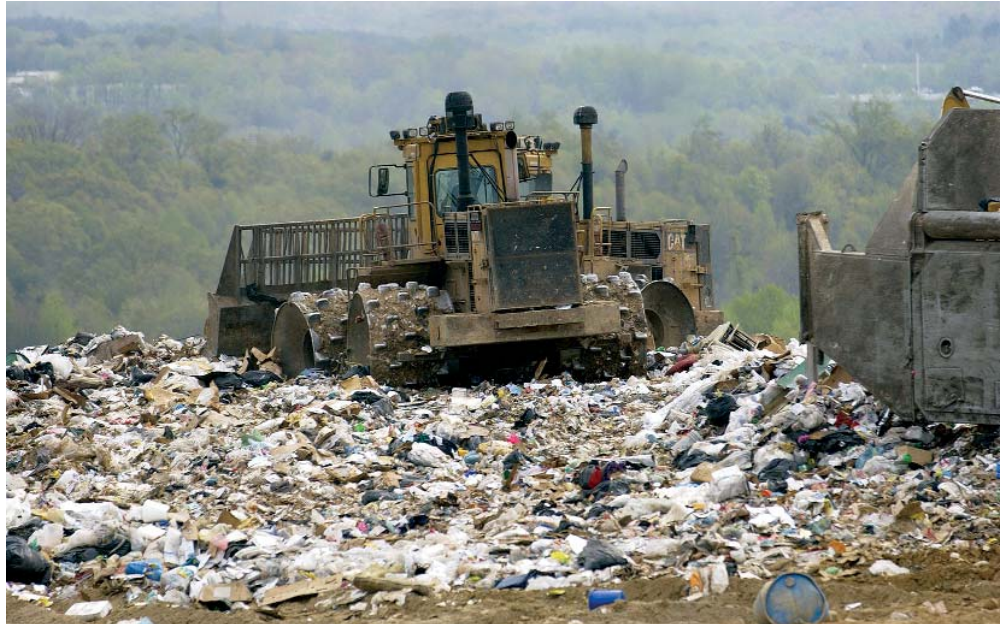
Landfills are the largest human-made methane source in the United States.

The additional use of methane gas reduced greenhouse gases the equivalent of driving a car around the globe 4,300 times, or more than 100 million miles.