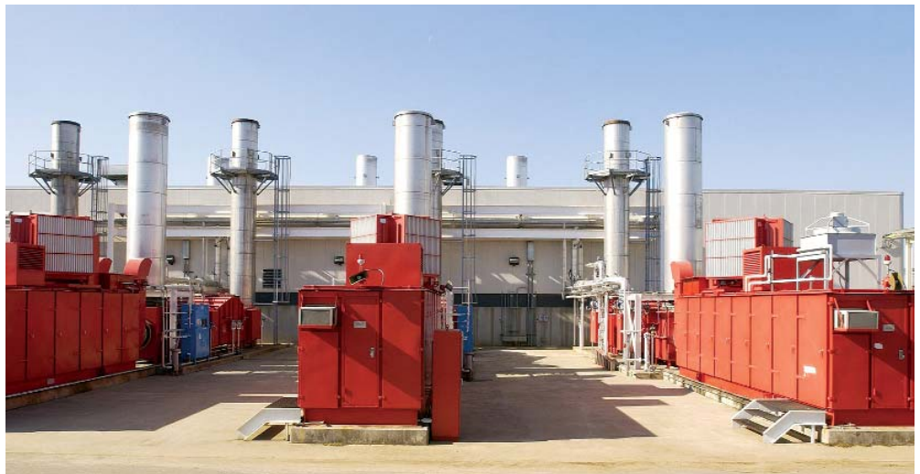
BMW constructed an unprecedented 9.5-mile pipeline from the landfill to its facility.