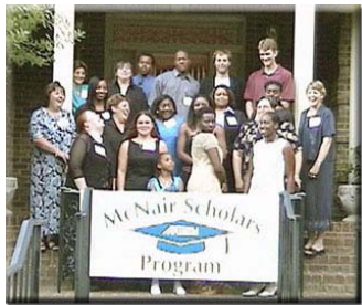
McNair Scholars Work for their Supper at Etiquette Dinner