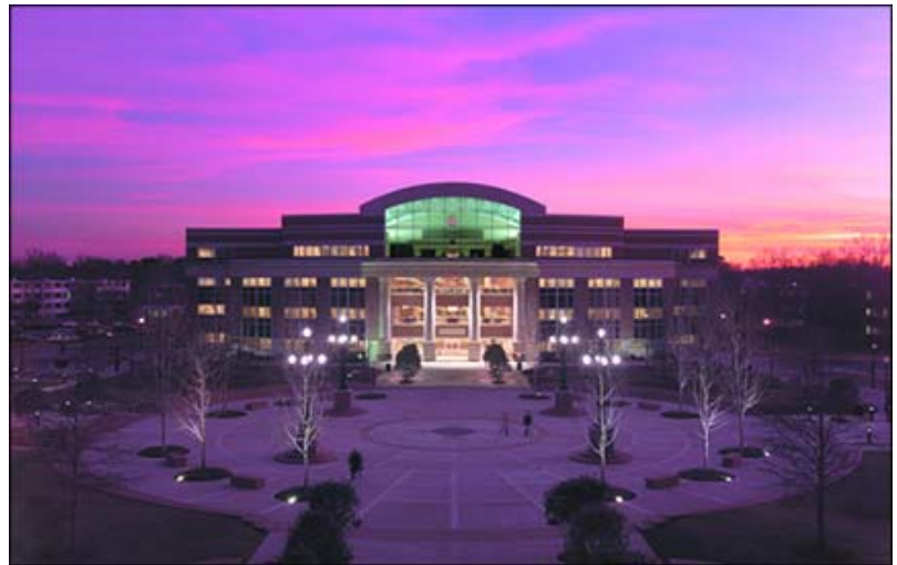
James Walker Library at Middle Tennessee State University